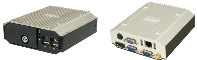
Front & Rear views of ESC-100 Controller with (2) serial ports